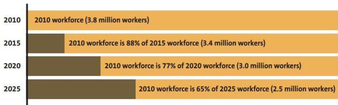
Source: Calculated by National Skills Coalition using population projections from the Indiana Business Research Center.